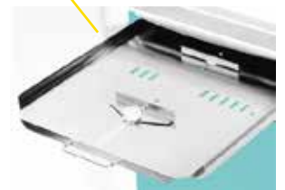
Steel bucky tray