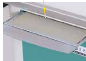
Removable x-ray grid