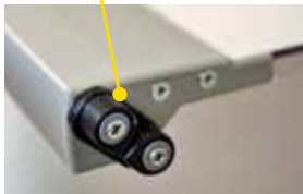
Cleat rope ties